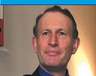
The Money Lender